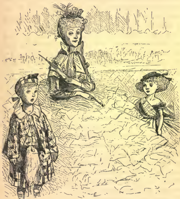
MRS. SALTONSTALL AND FAMILY.

more operative than before, sat on stools eating bonbons , while a French maid and the African footman hovered in the background.